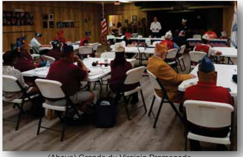
(Above) Grande du Virginia Promenade

(Below) Voiture 58 members support a Veterans Expo community Event.